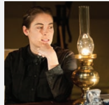
LAMDA'S SUMMER SEASON 2011

We look forward to sharing our work with you.